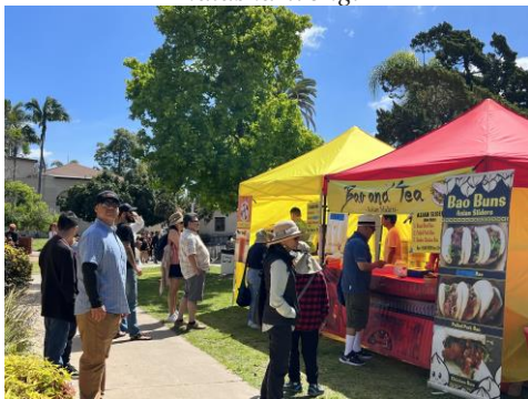
May 7 Ethnic Food Fair at Balboa Park. House of Bao team for food sales.