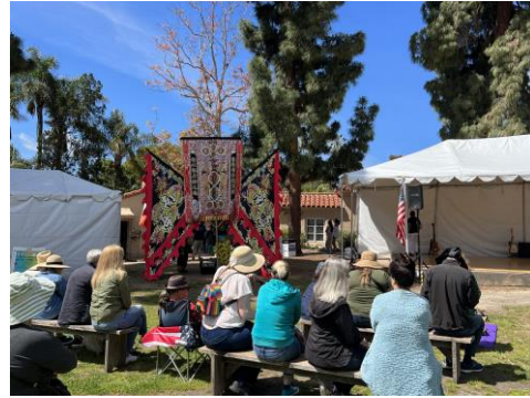
May 7 Ethnic Food Fair at Balboa Park. Southern Sea Dragon Banner