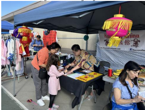
June 3 Dingeman Elementary School World Fair. Showing child how to use ink brush.