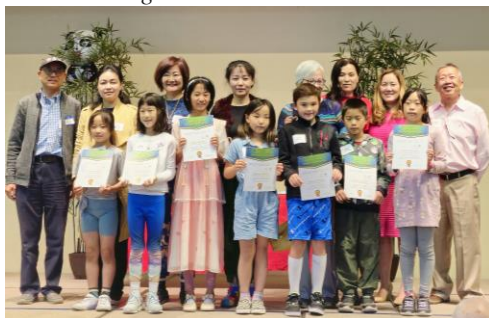
June 10 Essay Award Ceremony