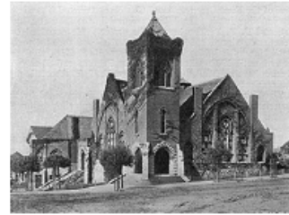
Between 1960 to 1961, the Chung Wah School relocated to two other churches before settling at the CCBA Building in Chinatown

Don't miss the conclusion of this three-part series on the history of Chinese schools in San Diego in our next Newsletter.