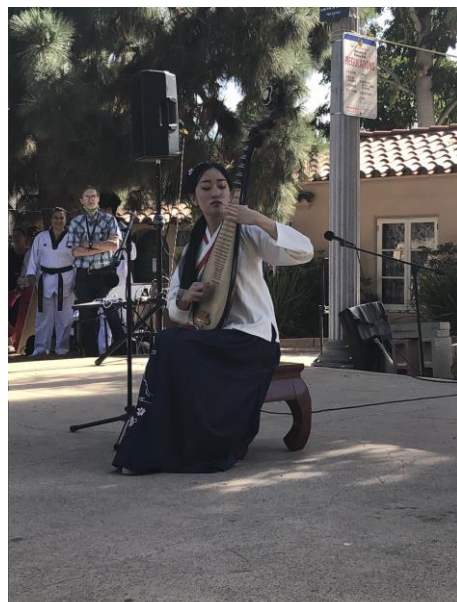
(10) Lute Music