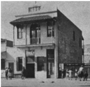
The Chung Wah School formally opened with 60 students at the CCBA Building in Chinatown, 1937