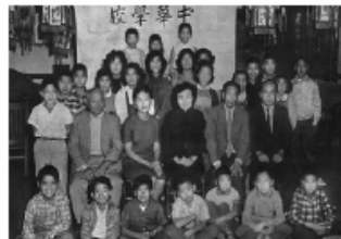
In 1964, the Chung Wah School in Chinatown was closed in due to its shrinking enrollment