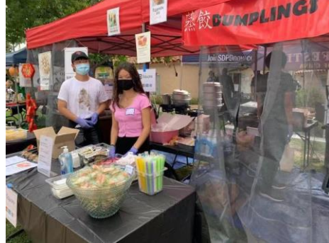
(7) Youth Care Volunteers