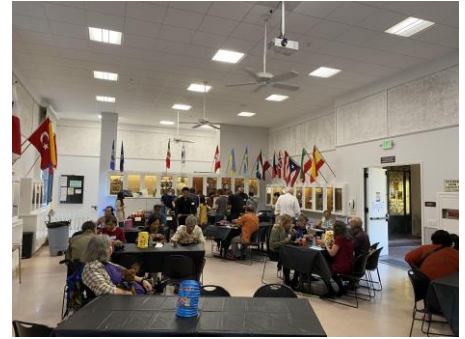
(5) Hall of Nations