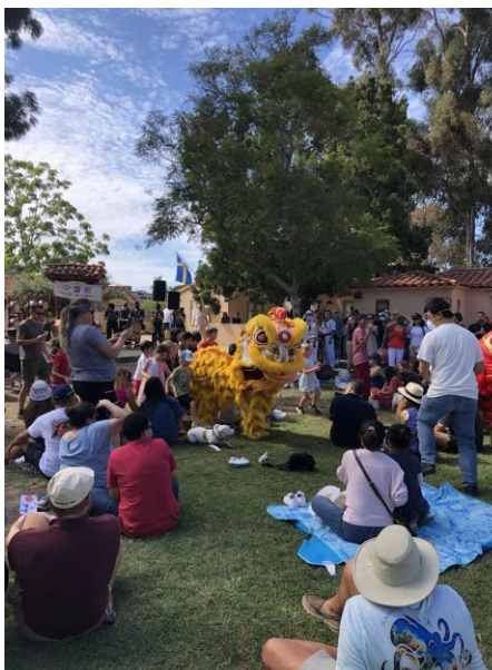
(9) Southern Sea Lion