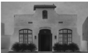
After 13 years without a Chinese school, the Chung Wah School was reopened in 1959 at the church