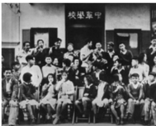
The Chung Wah School was "tuition-free" for all students from 1937 to 1946