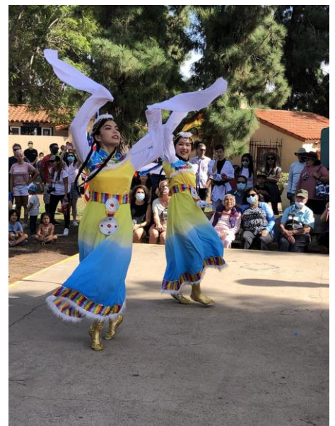
(11) UCSD Dancers