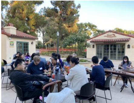
(3) Patio dining and music