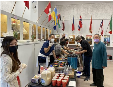
(6) Buffet Line